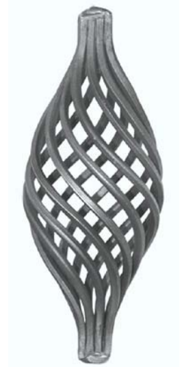
BK-20/1 Base 20x20 (0.605 kg.-1.333 lbs.) Dia. 85 x 197 mm.-3 1 / 4 x7 3 / 8 " 12 sections of 5x5