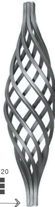
BKL-18 Base 20x20 (0.960 kg.-2.116 lbs.) Dia. 95 x 360 mm.-3 3 / 4 x14 1 / 4 " 8 sections of 6x6