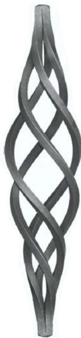
BKL-16 Base 16x16 (0.830 kg.-1.829 lbs.) Dia. 82 x 360 mm.-3 1 / 4 x14 1 / 4 " 4 sections of 8x8