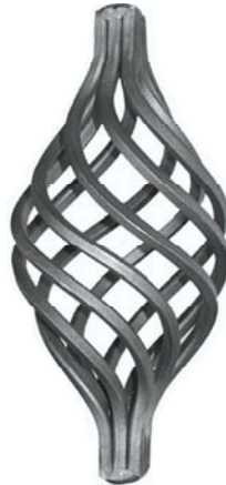
BK-16/1 Base 16x16 (0.335 kg.-0.738 lbs.) Dia. 68 x 158 mm.-2 3 / 4 x6 1 / 8 " 8 sections of 5x5